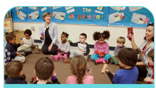
Watch to learn more about Music Together® in