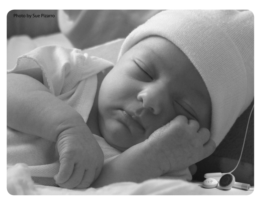
All the neonates showed significant differences in their heart rate and movements while hearing the music compared to the silent condition. They showed more state transitions (awake to asleep, etc.) and spent more time awake.

The limitations of this study include the fact that mothers in the experimental group may have become aware of the music vibrating on their abdomens, and their knowledge or feelings about this may have had an effect on fetal behavior. Another problem is that fetuses and babies change spontaneously and unpredictably: even the control group exhibited significant changes during their time of